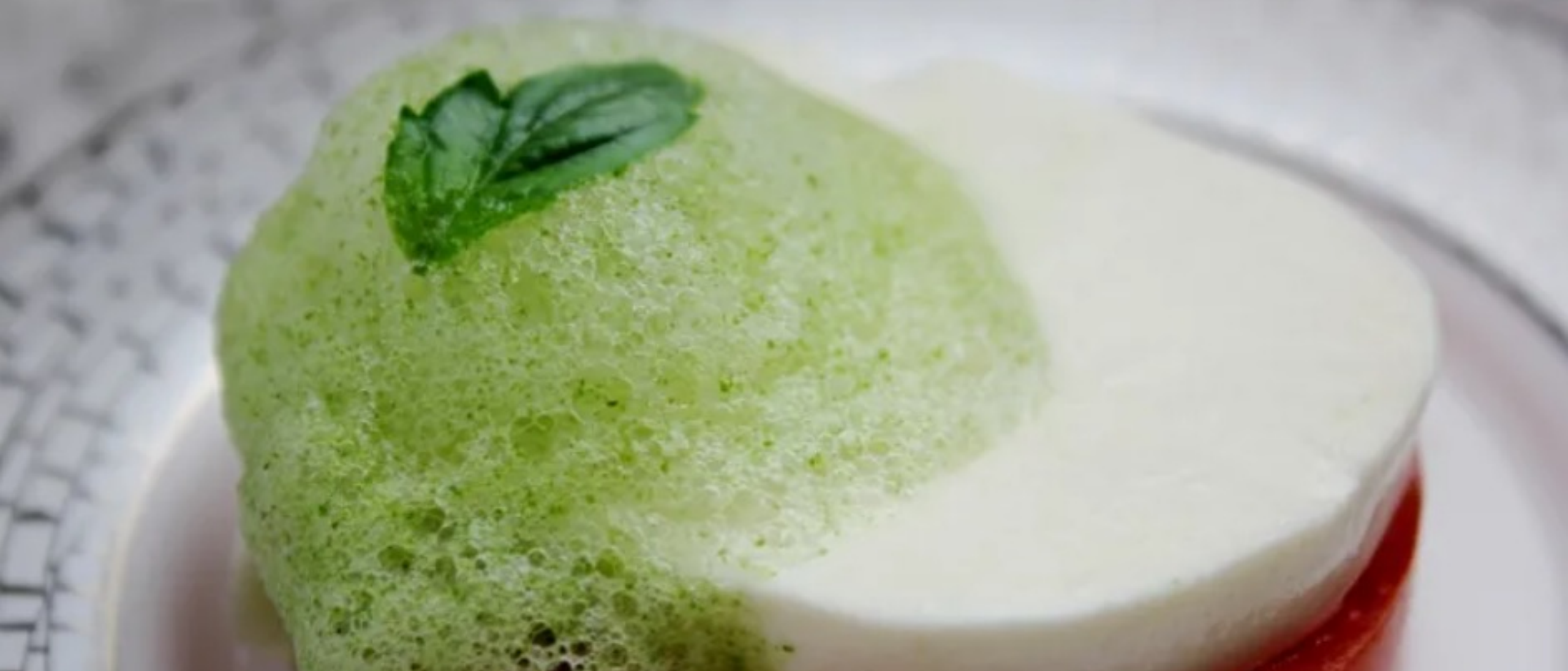
Soy Lecithin Oil Foam