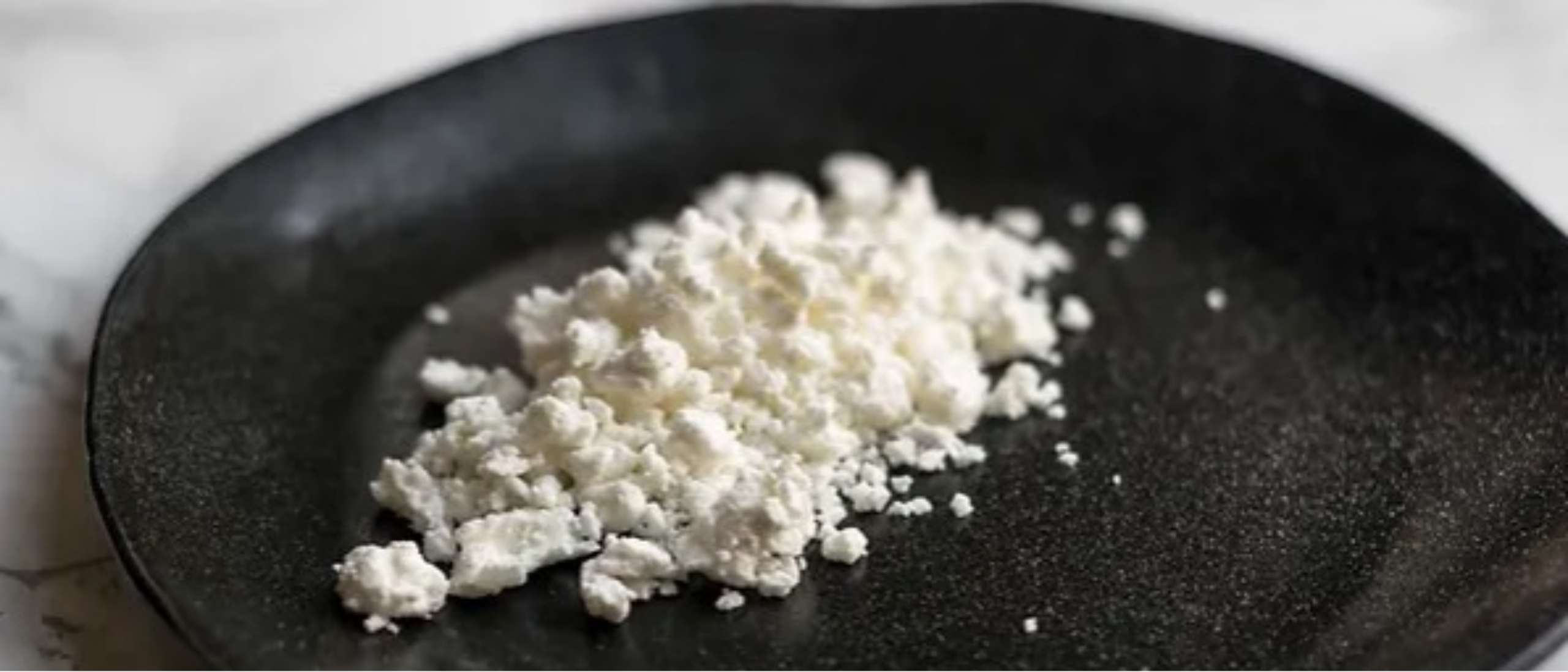
Tapioca Maltodextrin Oil Powder